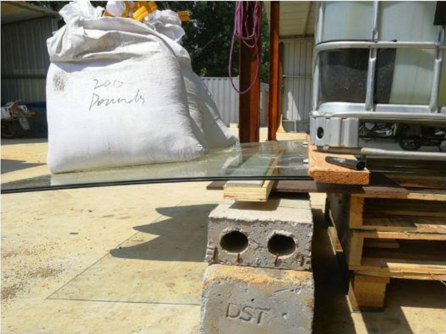
Photo 2: Loading of panel with sandbags, simulating horizontal force