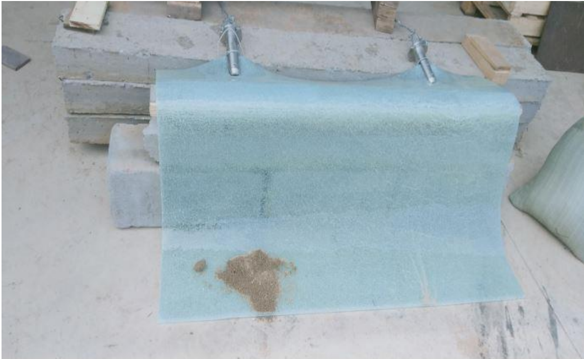
Photo 3: Panel after failure, showing all glass intact within laminate structure.

Due to the laminate construction of the panels (similar to a vehicle windshield), the panel broke into small pieces that were retained within the panel, preventing dangerous flying glass debris. See photo 3.